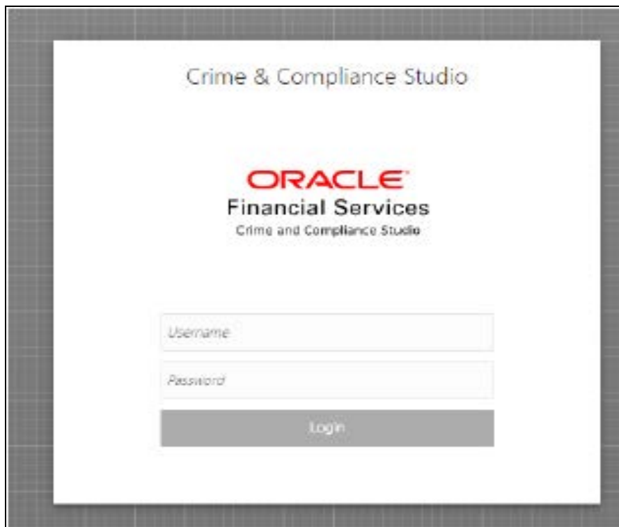
Figure 5: FCC Studio Application Login Page